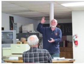
Ben Pests/Disease Control