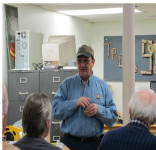
Mel Use of Refractometer