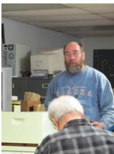
Greg Apiary Bear Fencing