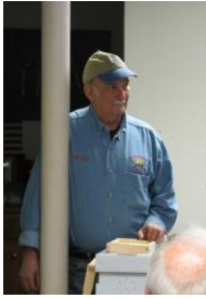
Harley Hive Management