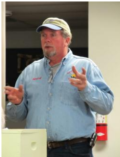
Gerard Hive Mgmt/Extraction